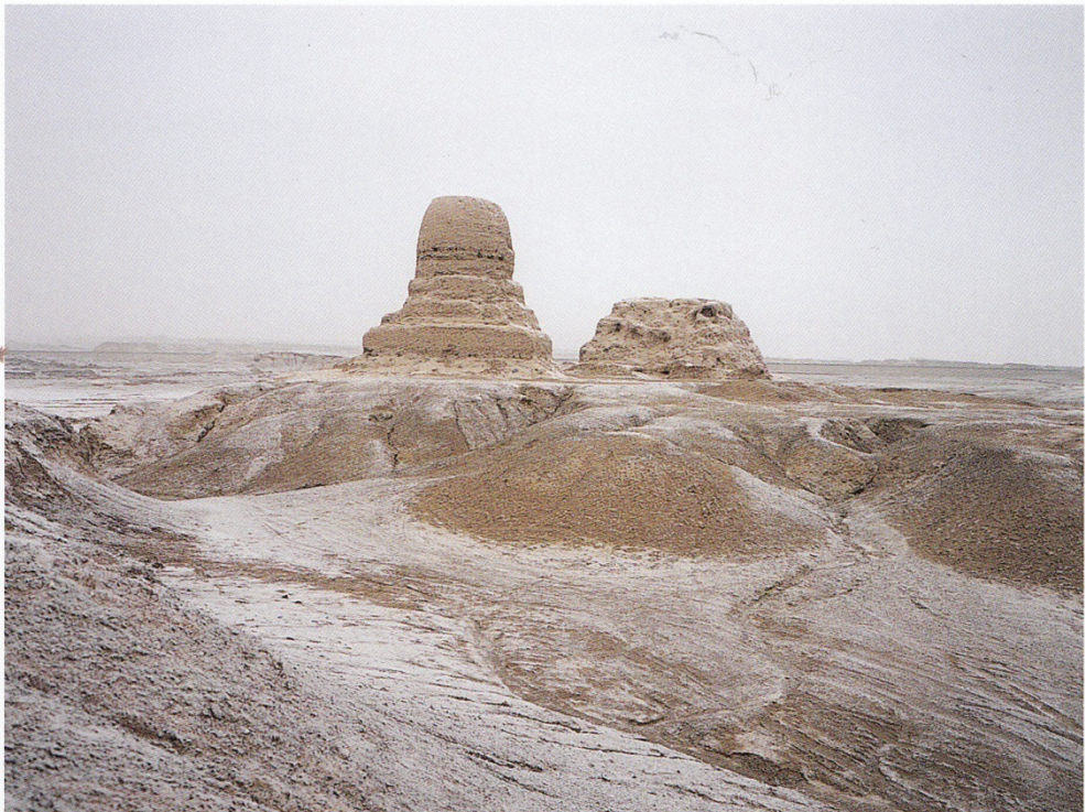
Pic. 5. The Mauri-Tim Stupa, near Kashgar, Xinjiang

Findings of Indian imprint in several other settlements in Chu valley (Sokuluk, Shish Tube, Kara Djigach, Burana etc.) testify to a wide settlement of Buddhists along the Silk Route system. Archeological excavations conducted in early twentieth century in Xinjiang particularly at Yotkan, Dandan Uiliq, Niya, Loulan, Turfan etc. unearthed some of the remnants of ancient Buddhist shrines and stupas with rich treasures of Buddhist images, Brahmi and Kharosthi MSS, wooden tablets and frescoes. The petroglyphs of stupas at Chilas and Thalpan have many similar features such as “hemispherical or parabolic domes on three or four rectangular foundations like those of stupas at Mauri Tim outside of Kashgar, Subashi near Kucha, Niya, Endere and Loulan.” [11. P. 294–295]. The Buddhist settlements extended upto Marghilan, Merv, Sogd, Eastern Turkestan (Xinjiang region of China) (in 3 rd and 4 th centuries AD) and beyond in the valleys of Chu, Talas and Ili rivers in the Semirechie (Kyrgyzstan) (in 5 th to 9 th centuries AD) [5. P. 41–42].