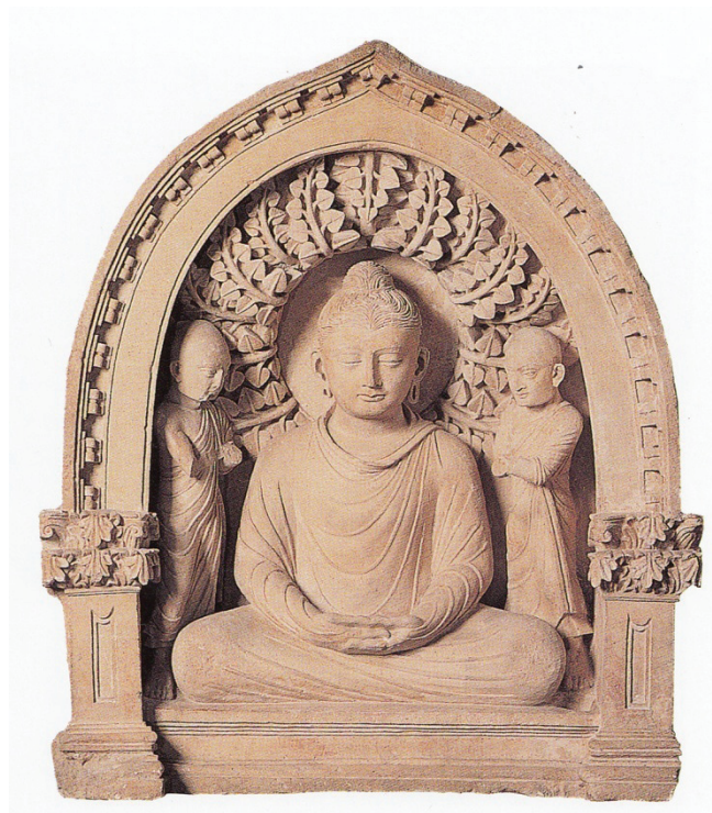
Fig. 4. Buddha seated beneath the Bodhi tree, flanked by two attendant monks (in Limestone) Kushan period (1 st –2 nd century AD) from Fayaz Tepe, Southern Uzbekistan (History Museum, Tashkent)

Results. Obviously it was through the Karakoram-Himalaya region, which was the crossroads of ancient routes and cultures and attracted travelers, traders and pilgrims, that Buddhism was transmitted to Central Asia and beyond. Several important places on the Silk Route system such as Kucha, Balkh, Bamiyan, Khotan, Kashgar etc. developed into important centres of Buddhism when parts of Central Asia and north-western India were integrated into a single kingdom under the Kushans.