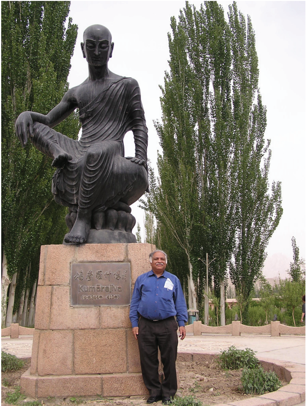
Pic. 8. Kumarajiva statue, Kucha cultural complex, Kucha, Xinjiang

to their respective countries, only 8 caves are now open to public view. Cave No. 17 has elaborate murals depicting Indian characteristics. A statue of Kumarajiva is erected in the Kucha cultural complex, which is well maintained. These frescoes need to be reconstructed and preserved.