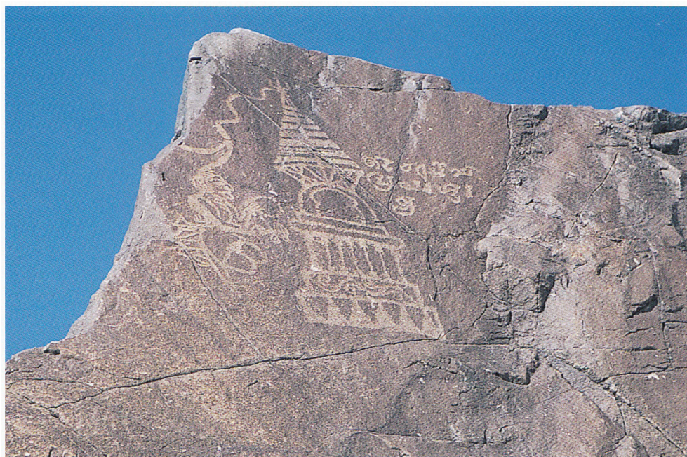
Pic. 3. Petroglyph depicting a stupa with attendant (8th century AD), Chilas

gion to Central Asia Notwithstanding its difficult terrain of high and cold mountains and very limited material resources, the Karakoram Himalayan region acted as the transit zone for transmission of Buddhism to Central Asia. The traders, monks and local patrons particularly the Palola Sahi dynasty of 7 th –8 th Century AD, contributed to the establishment of Buddhist presence in the region.