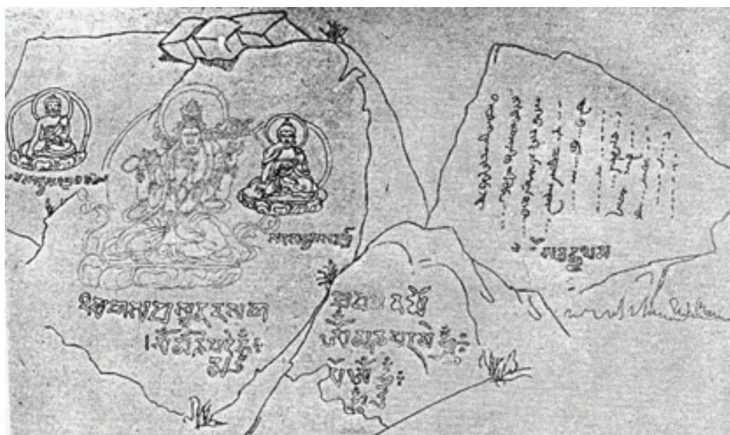
Pic. 6. Buddha images and inscriptions, Tamgaly-Tas, Kazakhstan (Drawing by Chokan Valikanov, 1856)

The local museum in Chimkent, a town in southern Kazakhstan has a number of artifacts, particularly farming tools, household items, yurts, stone items etc. which demonstrate close resemblance to the lifestyle in the Western Himalayas. Some Zoroastrian artifacts are also preserved here. It would be relevant to mention about the artifacts preserved in Sairam, another ancient Kazakh town on the Silk Route. There is an ancient pillar with Sanskrit inscriptions in Brahmi and Kharoshthi script in a local mosque at Sairam, which is also a mausoleum of the mother of the famed saint of Turkestan, Ahmad Shah Yasavi. In the small local museum, one found another such pillar, old plough, spinning wheel, old MSS in Arabic script and other antiquities. One such pillar is reported to be in the Hermitage Museum, Leningrad. Recently an ancient Buddhist site has been discovered in Sairam, where a lamp of XII century was found. The mausoleum of Aisha Bibi (12th century) in Dzhabol (Taraz) has a twelve-cornered dome like the Indian temple roof tops. Symbols of octagon and swastika are found to be engraved in some stone pillars. At another mausoleum of Karakhan (in Taraz), stone images and human figures were stored.