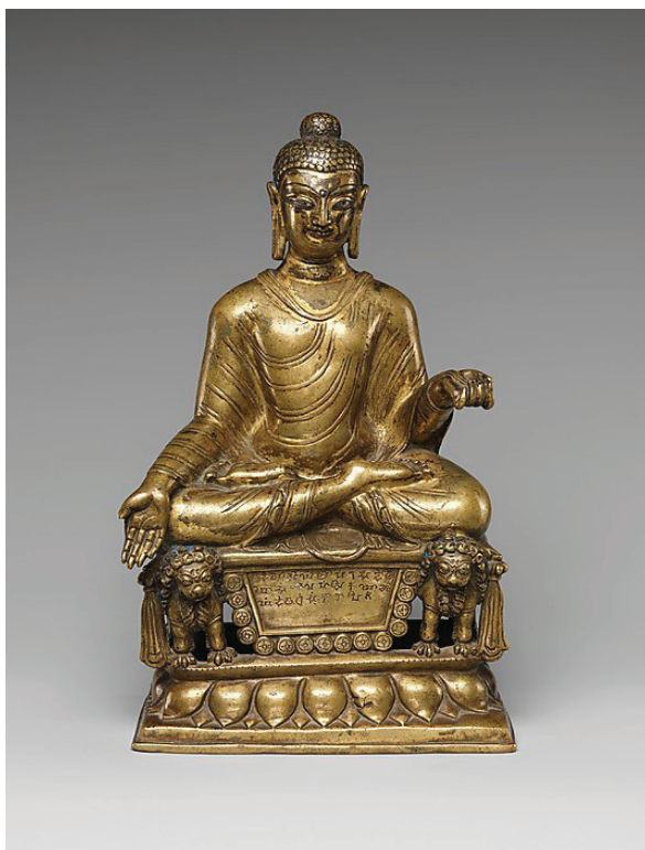
Pic. 2. 6 th century Gilgit-Buddha Shakyamuni (Metropolitan Museum of Art)

About six miles from Gilgit town there is a boulder with an engraving of Buddha carved out of the rock at the mouth of Kargah nullah. Hence it is called Kargah Buddha [10. P. 66]. Near Satpara lake, about eight kms. south of Skardu, is a huge boulder on which meditating Buddha surrounded by Bodhisattvas are carved [10. P. 101]. The preponderance of rock carvings and inscriptions of pre-historic and Buddhist period in Gilgit-Baltistan area provide sufficient evidence of the prevalence of Buddhism in this region in pre-Islamic times. Several rock carvings of Buddha at the sites of Shaital, Thor, Thalpan, Shing Nala, Satpara, Kargah, Chilas etc. still exist.