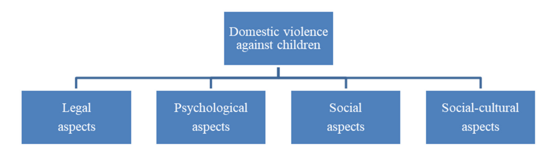
Figure 1. Social-humanitarian research of domestic violence against children

Russia ratified the document with reservations (Federal Law of May 7, 2013): Russia supports most of the provisions, but it is important to implement them following the norms of current legislation and customary law, based on the principles of reasonableness and expediency. Besides, there are several problems that require addressing not only by jurisprudence, but by other social-humanitarian sciences (Fig. 1).