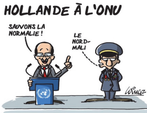
Figure 1. Polycode text of the political cartoon “Hollande at the UN”

Let us give two examples of the reception and analysis of a polycode text of different genres with some explanations.