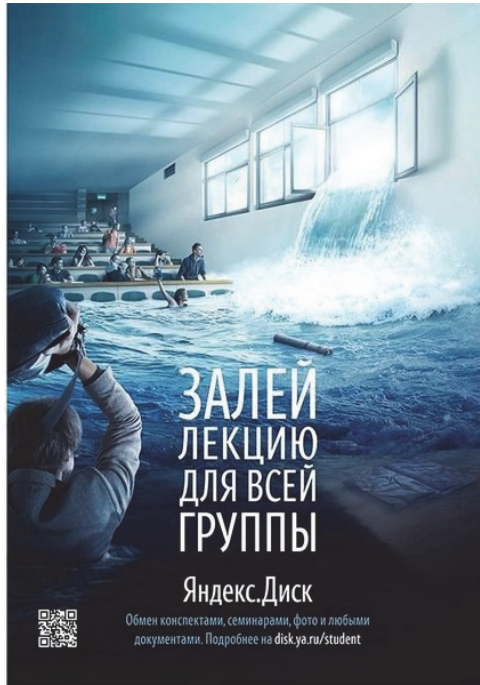
Figure 2. Polycode text of printed advertising “Yandex. Disk”

Meaning ‘fill completely; fill the whole space’, which is implemented in this context, has now received a new meaning ‘to copy information to a digital medium,’ which is actualized in the verbal component of the polycode advertising text. This meaning is not lexicographed but it is known to a native speaker of the Russian language. The first considered meaning of the lexical unit to fill up is realized in a non-verbal component (to flood the room during a lecture), thus, a play on words is used, the verbal component in this case implements the primary function, the non-verbal component complements it.