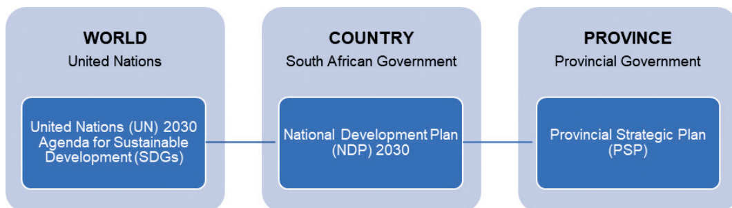
Fig. 2. Strategic Alignment — UN, South Africa, Western Cape

Part of the South African government’s initiative to ensure good service delivery was the introduction of a Provincial Strategic Plan (PSP). A PSP is the Provincial Government’s strategic plan for its term of office. The strategic priorities of the PSP are sub-divided amongst its departments for implementation. The PSP must be strategically aligned with the NDP 2030 and the UN 2030 Agenda for SDGs [56]. If the provincial government departments cannot deliver on their PSP, the resultant impact will be that both the NDP 2030 and the UN 2030 Agenda for SDGs will be negatively affected. Fig. 2 below displays the strategic alignment between the UN, the South African Government and Provincial Government.