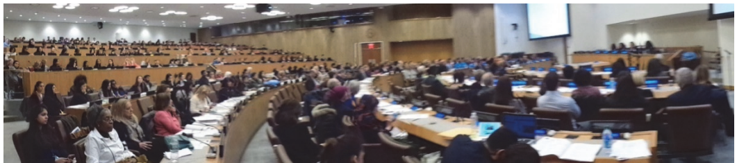
Figure 3. By contrast, a scene from UNPD 2019