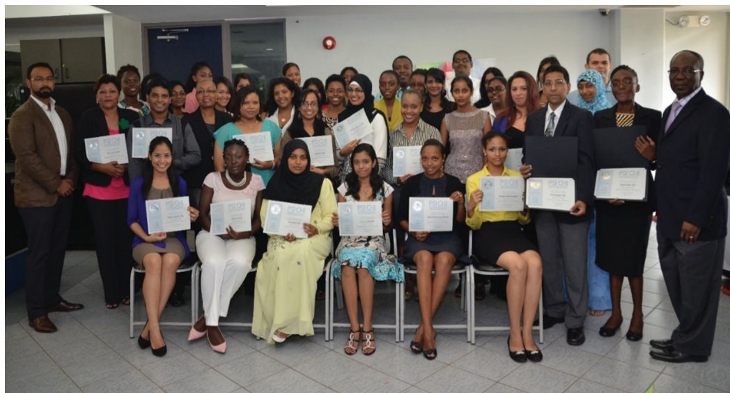
Figure 9. The UWI St. Augustine Campus Psi Chi Chapter Installation Ceremony

4. Since 2013, The UWI Chapter has developed five unique activities.