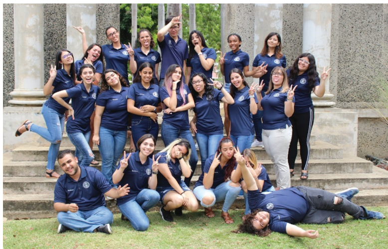
Figure 3. New members of UPR-M Psi Chi Chapter