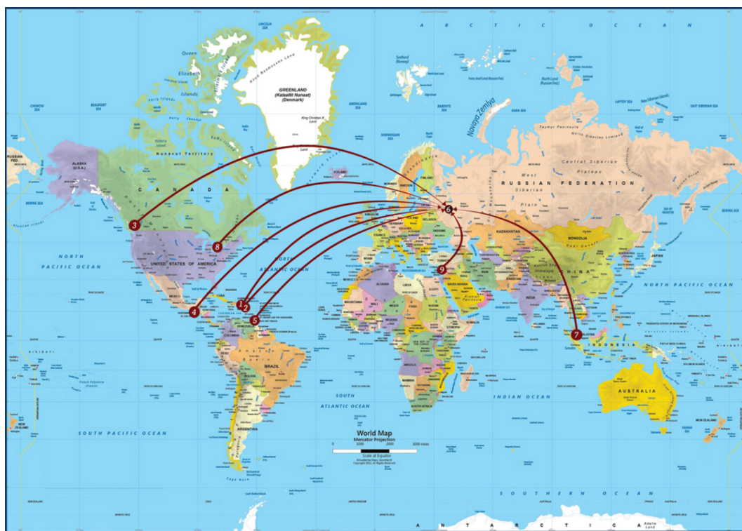
Figure 1. World map 1 with 9 international Psi Chi Chapters that presented their reports:

1 — University of Puerto Rico of Mayagüez (Puerto Rico); 2 — University of Puerto Rico at Rio Piedras (Puerto Rico); 3 — University of British Columbia (Canada); 4 — University of the Valley of Guatemala (Guatemala); 5 — University of the West Indies (Trinidad and Tobago); 6 — Peoples Friendship University of Russia (RUDN University) (Russia); 7 — HELP University (Malaysia); 8 — University of Toronto Scarborough (Canada); 9 — University of Nicosia (Cyprus)