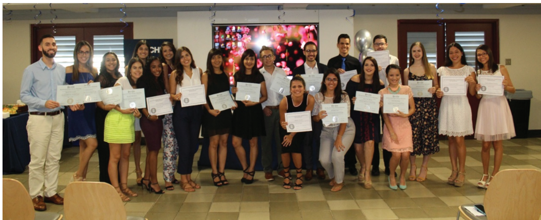
Figure 5. Introduction ceremony at UPR-RP Psi Chi Chapter, 2018