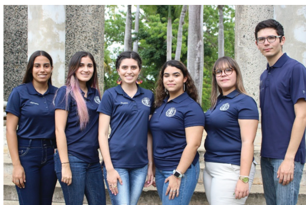
Figure 4. New Board of directors of UPR-M Psi Chi Chapter