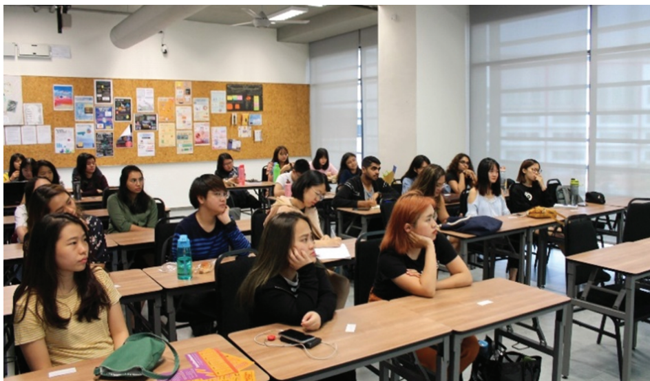
Figure 13. Sexual Harassment Awareness Talk (February 2019)