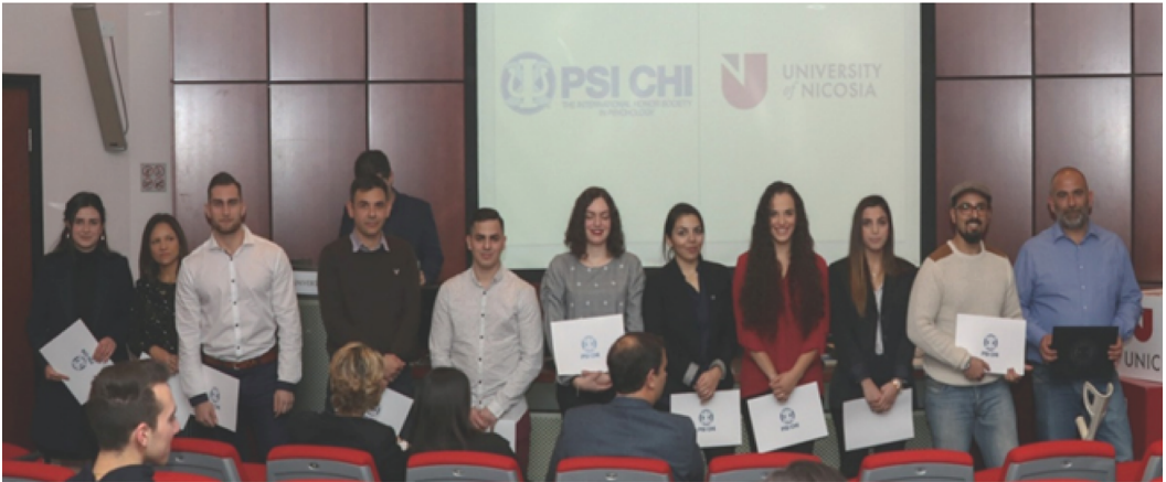
Figure 15. UNIC Installs its Psi Chi Chapter in Cyprus on January 31, 2018