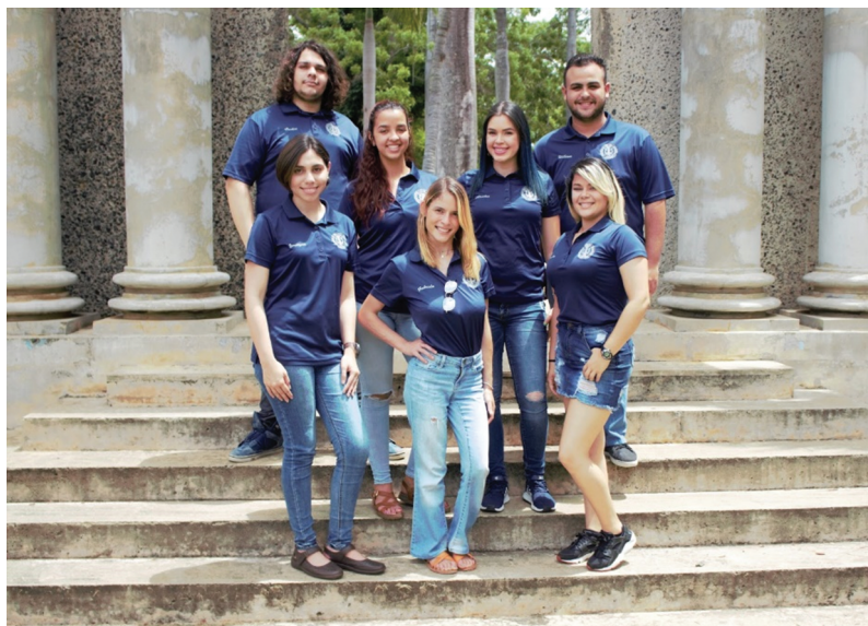
Figure 2. Current Board of Directors of UPR-M Psi Chi Chapter

4. In our chapter, we conceive community service as an integral part of the activities to be accomplished. The purpose is for members to have an experience beyond the academic realm and apply what they have learned to a real-world context. To accomplish this objective, we carried out several community service activities.