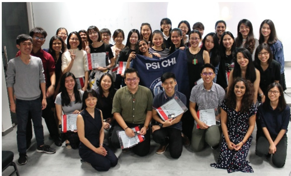
Figure 12. Induction Ceremony and Game Night (January 2019)