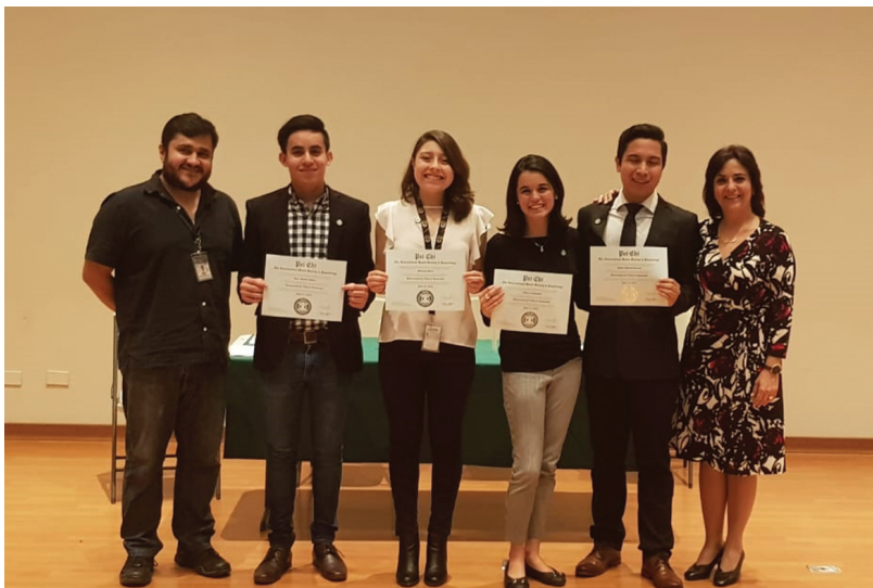
Figure 7. 5th Anniversary of the Latest Psi Chi Chapter in Guatemala on July 20, 2018

2. UVG was the first university in Latin America to install a Psi Chi Chapter, in the year 2012 after two years of preparation. For the past six years there have been four different inductions, accounting for more than 40 Psi Chi members (Figure 7).