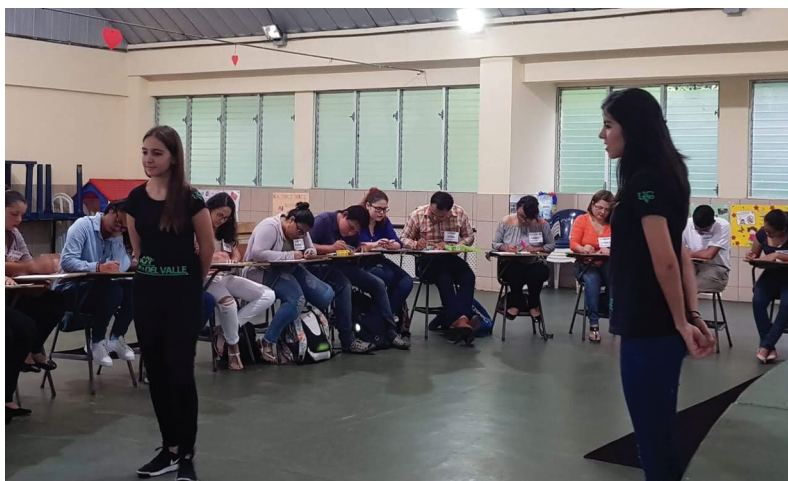
Figure 8. Psi Chi Chapter Staff Working with Those Affected by Natural Disasters

5. For the future, the Guatemalan Chapter is committed to increase and expand international collaborations with Central America, the Caribbean, and other university Chapters in other regions of the world. Expand the outreach and membership of the Chapter in Guatemala. Another plan is to participate in conferences and congresses not only as attendees but as professionals. Lastly, it is also a plan to earn grants to expand the field of Psychology in Guatemala.