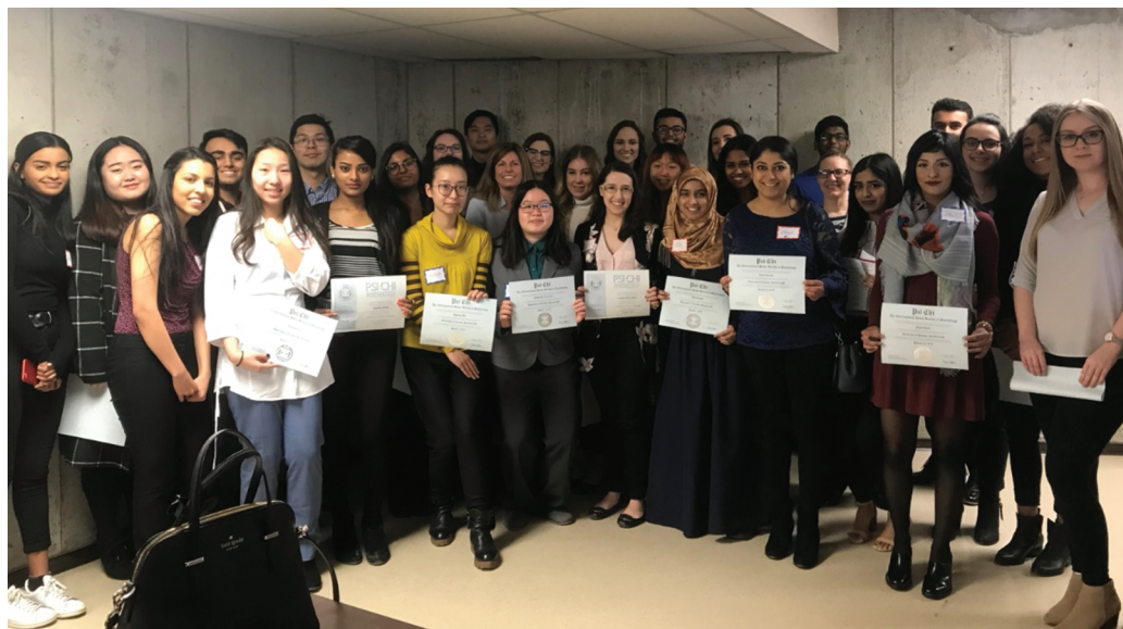
Figure 14. Inaugural Induction Ceremony for the University of Toronto Scarborough's Psi Chi Chapter in March of 2018