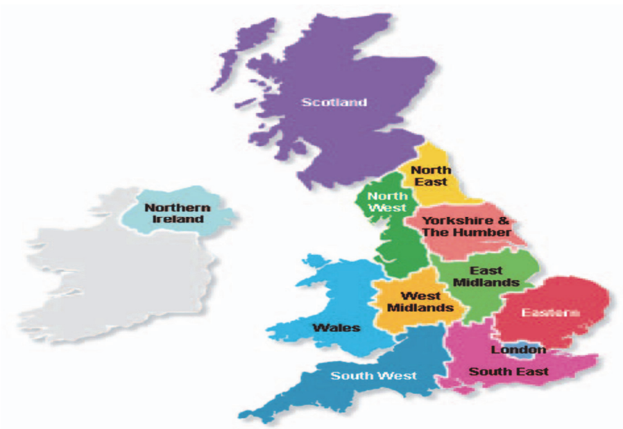
Fig. 1. The nine regions in England and Wales, Scotland and Northern Ireland

South Yorkshire, Tyne and Wear, West Midland and West Yorkshire. Each one covers a large urban area, typically with populations of 1.2 to 2.8 million; the six metropolitan counties are divided into 36 metropolitan districts covering the crowded populated urban areas [2. P. 3].