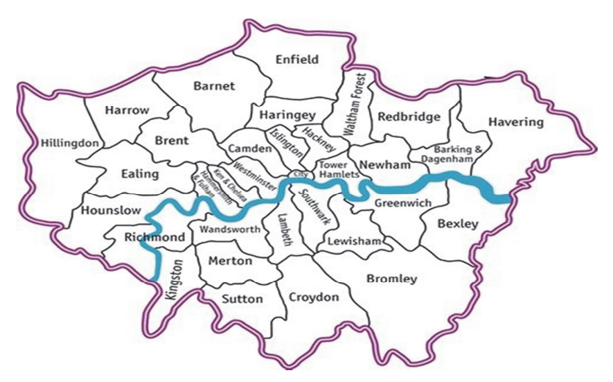
Fig. 3. Map of London Boroughs

In all, there are 32 boroughs in the City of London, each with their own local government, school centers, suburbs and proud sense of identity and history. Each borough has a representative in Parliament. The boroughs are divided into five groups: the Inner East and South, Inner West, Outer South, Outer West, North West, and Outer East and North East [12. P. 9].