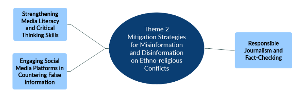
Figure 2. Mitigation strategies for misinformation and disinformation on ethno-religious conflicts

Among the strategies coming from Nigerian informants, Inf. NigCL 9 suggests, "Critical thinking skills need to be emphasized in educational institutions. The ability to question and evaluate information is a powerful tool in countering the impact of misinformation". Inf. NigPM 11 calls for a comprehensive media literacy campaign, while Inf. NigPM 12 suggests continuous awareness campaigns on misinformation.