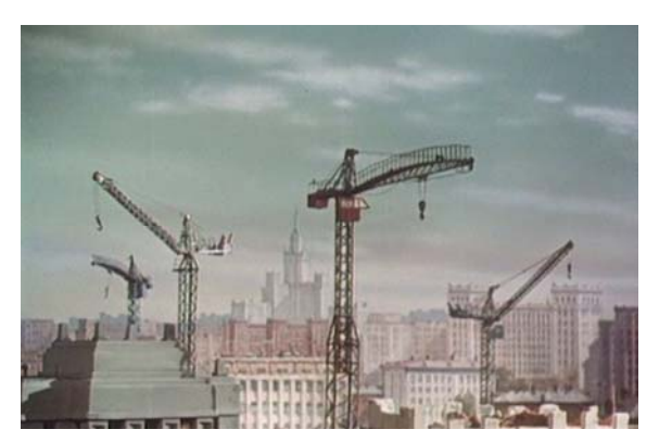
Fig. 7. The multimodal metaphoric representation based on the word-combination razvodya ruki v storonu

(3) Coach (voice over, radio broadcasting): Razvodya ruki v storonu , glubokiy vdokh. – Arms out to the side and deep inhalation . (The use of the phrase is followed by the image of several cranes turning their moving booms in opposite directions) (see Fig. 7)