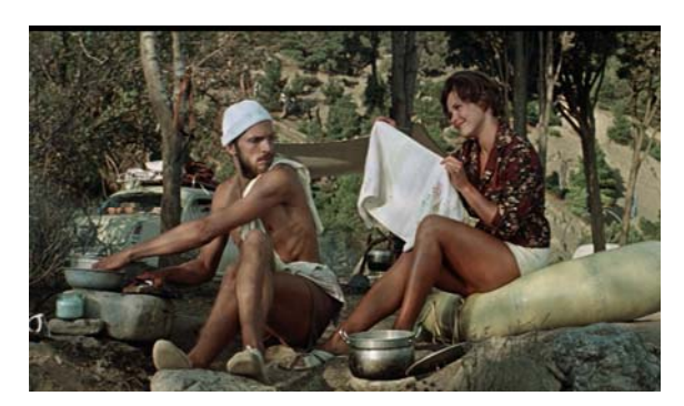
Fig. 4. The cinematic metaphor of "taming a bachelor-misogyny"

(1b) Zoya: Dlya vashego zdorov'ya karlovarskaya voda byla by nezamenima.