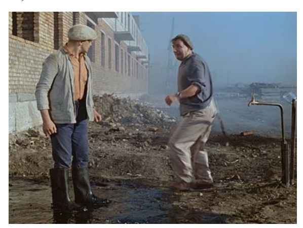
Fig. 15. The cinematic metaphor based on the verb vlipnut'

(10) Fedya: A, vlip, ochkarik? – Aha, you're in trouble, four-eyes? (see Fig. 15).