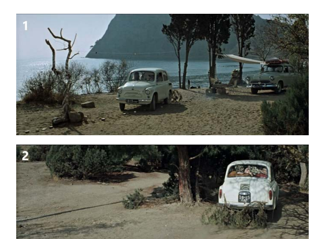
Fig. 11. The cinematic metaphor based on the phraseological unit zametat' sledy

(6) zametat' sledy (lit. to cover one's tracks) – 'to hide or destroy evidence of something, usually of one's involvement in something reprehensible' (The cinematic metaphor based on this phraseological unit unfolds in a series of dynamic images (see two of them in Fig. 11)).