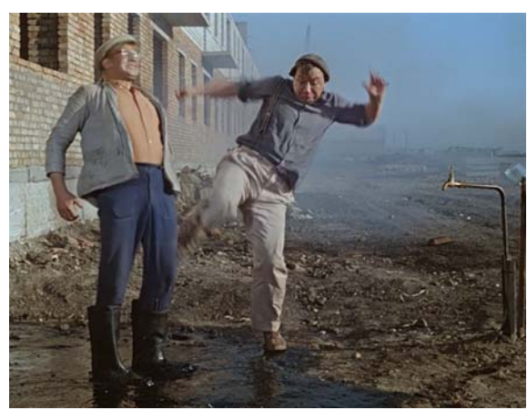
Fig. 16. The cinematic metaphor based on the noun avans

(11) Fedya: Eto tol'ko avans – It's only an advance (see Fig. 16).