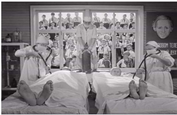
Fig. 17. The extended cinematic metaphor based on the idiom portit' krov' komu-libo