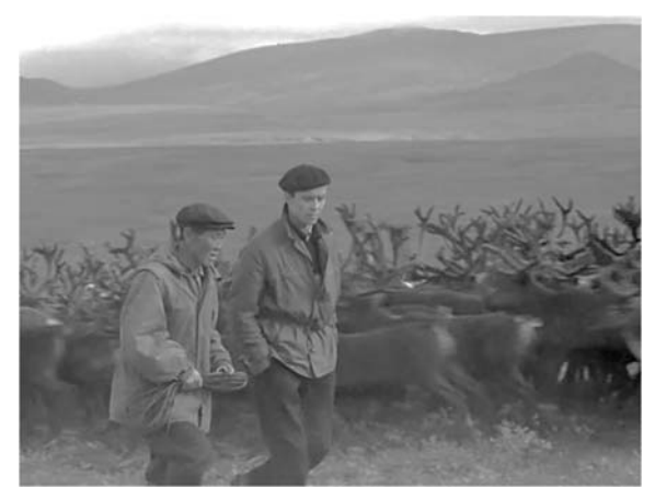
Fig. 12. The cinematic metonymy based on the figurative utterance from the song

(7) My shagali po peskam pustyni – We walked across the sands of a desert (The poetic image conveyed by this expression is displayed by means of corresponding audio-visual and kinesthetic elements that form a cinematic metonymy (see Fig. 12)).