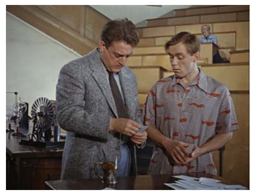
Fig. 14. The cinematic metaphor of taking an exam as gambling

The cinematic metaphor formation results in the actualization of two senses of bilet , one of which is prescriptive and the other is new (occasional): 'thick, stiff