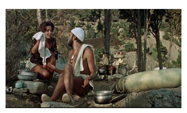
Fig. 5. The cinematic metaphor of "taming a bachelor-misogyny"

Zoya: O, net, net. Nichego, nichego. – Oh, no, no. Nothing, nothing.