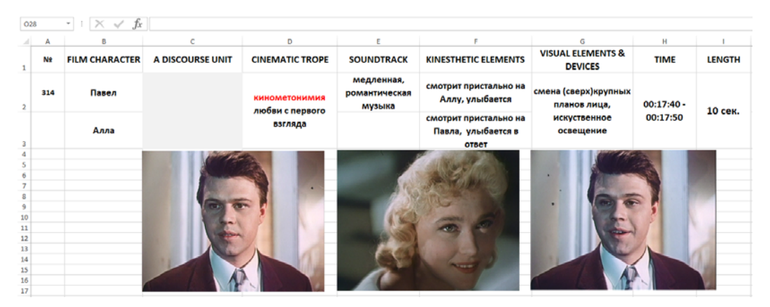
Fig. 3. Variant of annotation 3: Extract of the Microsoft Excel annotation of the film "Sem' nyanek"

As transposing a verbal unit into a new – multimodal – form inevitably leads to its transformations, the third stage focuses on the extent and kind of these transformations. Target verbal units are analyzed in accordance with the following aspects: a) structural changes; b) grammatical changes; c) semantic changes; and e) pragmatic changes. This stage of the research helps to evaluate how the process of cinematic tropes' creation can modify the verbal units that underlie it.