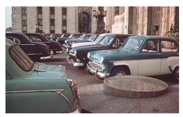
Fig. 6. The multimodal metaphoric representation based on the word vstali

(2) Coach (voice over, radio broadcasting): Vstali! – Stand up! (The use of the verb is accompanied by the image of cars standing in a parking place) (see Fig. 6).