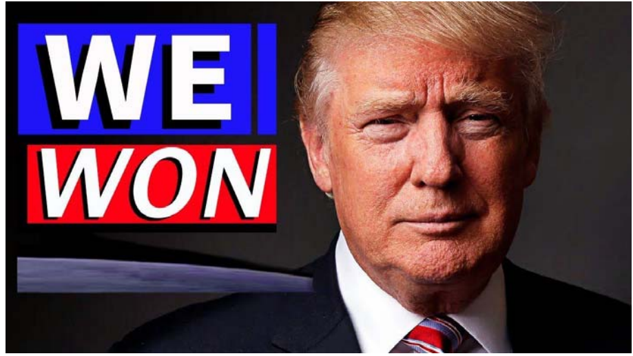
Figure 3. Descriptive representations of Trump's power in 4Chan memes

formal occasion and he is someone to be respected. The colours of the accompanying writing and surrounding boxes mirror those of the American flag suggesting a national event. What has been 'won' is not indicated in the thread or image, though it is likely the meme originally referred to Trump's election in 2016. In any circumstance, this is an empowering image. But like the images in the previous section, this is more symbolic than real. The background, again, gives no clues as to any particular event or issue. The image and context connote no real action and agency. Trump is not represented doing anything to anybody. However, this meme is about his power and 'us' being a part of this, though nothing is defined or quantifiable.