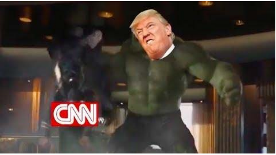
Figure 6. Trump as the Hulk from The Avengers film (2012)

In figure six, Trump again dominates the image. Here, his head is mashed on to the Hulk from The Avengers film (2012). In this image, Trump faces us, allowing viewers to witness his anger. The vertical angle of interaction emphasises his strength. In the original film, the Hulk fights Loki, a villain. Here Trump's head is mashed on to the superhero's body as he holds the villain by the feet in a sequence that sees the Hulk physically brutalise Loki. It is a one-sided fight due to the Hulk's enormous strength. Here, the superhero Trump physically brutalises CNN. This show of strength and connotations of who is right and who is wrong would not be lost on viewers, confirming their beliefs that mainstream media are wrong, it being 'fake news'. All the while, the meme offers no evidence or context for such assertions, just metaphoric over literal representations of actions that emphasise power and anger.