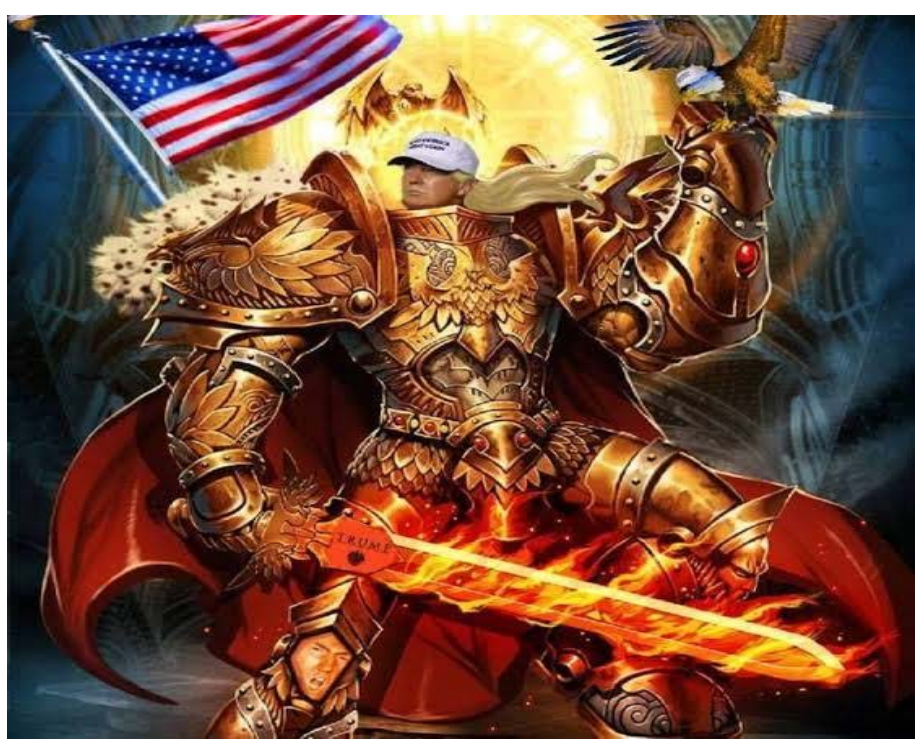
Figure 2. Symbolic power and nationalism in 'God Emperor Trump' images

Like the posts, the meme expresses admiration for Trump. Again, this is not about 'real' political power, like the power to cancel Obamacare, build a wall on the Mexican border, close the borders to Muslims or curtail criticisms in the press. This is symbolic power, confirming posters' admiration and pride towards Trump and Trump's America. Similarities between figures one and two include Trump's head mashed-up with the body of Emperor of Mankind. Both images see Trump's head small, yet salient through the use of colours, lighting and focus. Low modality through an indistinguishable background is also common, connoting both symbolic power over 'real' power and Trump as a mythical character.