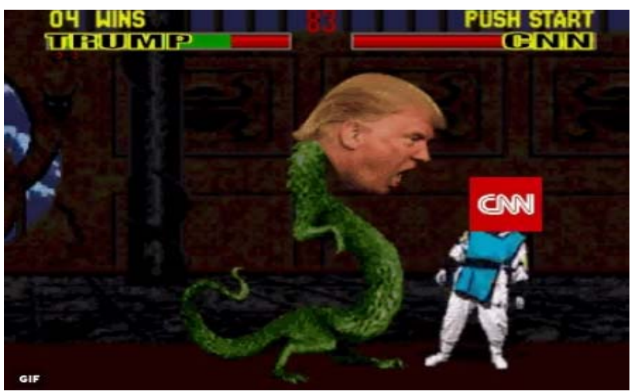
Figure 5. Meme of Trump as Liu Kang from the Mortal Combat game

In figure six, Trump again dominates the image. Here, his head is mashed on to the Hulk from The Avengers film (2012). In this image, Trump faces us, allowing viewers to witness his anger. The vertical angle of interaction emphasises his strength. In the original film, the Hulk fights Loki, a villain. Here Trump's head is mashed on to the superhero's body as he holds the villain by the feet in a sequence that sees the Hulk physically brutalise Loki. It is a one-sided fight due to the Hulk's enormous strength. Here, the superhero Trump physically brutalises CNN. This show of strength and connotations of who is right and who is wrong would not be lost on viewers, confirming their beliefs that mainstream media are wrong, it being 'fake news'. All the while, the meme offers no evidence or context for such assertions, just metaphoric over literal representations of actions that emphasise power and anger.