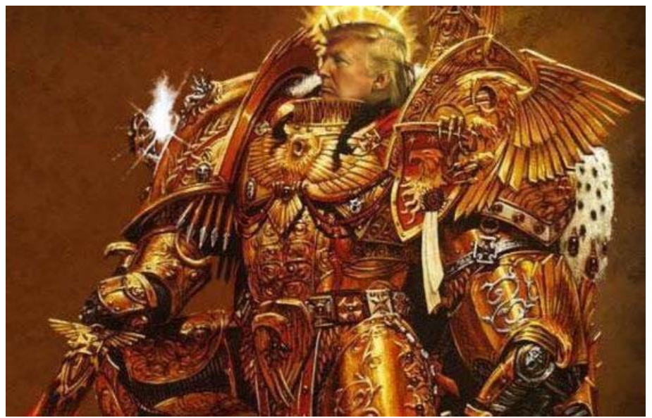
Figure 1. 'God Emperor Trump' image in pro-Trump 4Chan thread

small compared to the massive body in the montage. However, both head and body are salient connoting importance and power. His body is salient through its size. But the meme's message of Trump as powerful would be lost on his fans if his head was difficult to identify. Light, focus and colour make his head salient. Furthermore, it is in focus and importantly, the creator of the image has suggested other-worldliness by including what looks like a halo around Trump's head to guide our eyes towards him.