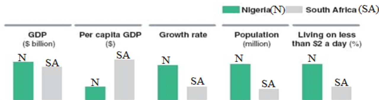
Fig. 1. Nigeria overtakes South Africa