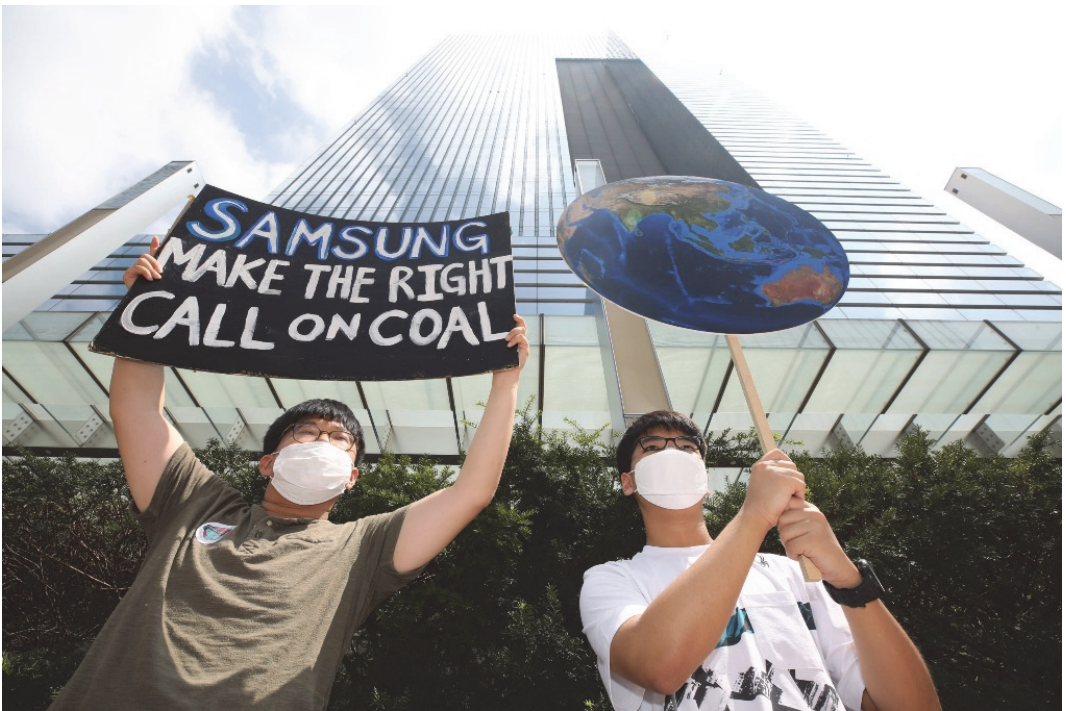
Figure 1. Young eco-activists outside Samsung’s Seoul HQ in August 2020, protesting against the controversial Vung Ang 2 coal power plant in Vietnam

In South Korea, ecological campaigns have been an integral part of the democratic transition since the 1980s. Most of the first generation of environmental activists were university students. Nowadays South Korean eco-friendly campaign tactics include environmental symbolic acts to trigger a dramatic public reaction and push for policy change (see Figure 1).