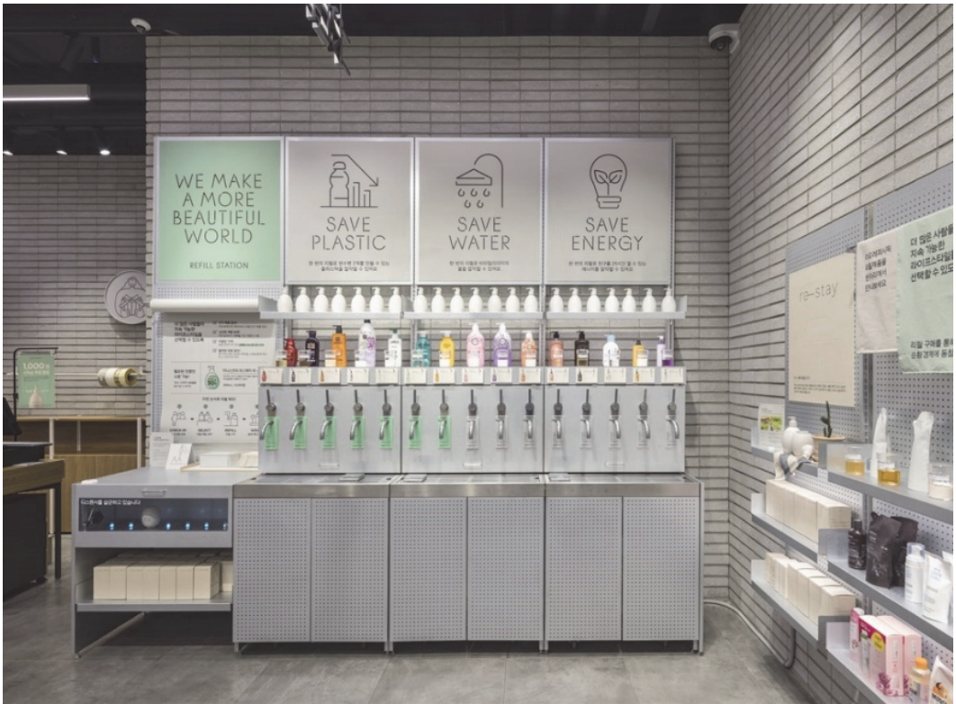
Figure 3. The English language “refill station” of a cosmetic Korean brand “Amorepacific” as an example of environmental activism in South Korea, presented by the English language media in the country 12

The same environmental policy can be observed in Singapore and Indonesia, the countries which are promoting the idea of the Green Plan for their future national development and gradual elimination of environmental and health disturbances.