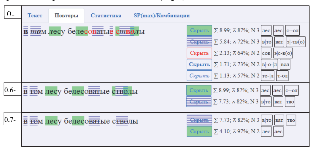
Fig. 2. Picture of sound repetitions highlighted by the "Phonotext" web service in the initial verse of Nikolay Gumilyov's poem "Forest" at different levels of filtration

One of the principle operations done by the web-application concerning the SCG associative strength index ( IAS ( x )) is filtering results . Already emphasized and valued phonosyllabic chains undergo additional selection according to the index of the potential associative strength, assigned to each chain link. At the stage of text digitizing, a user can set the lower and upper boundary of the filter (IAS-1 is set in the multiple form of 10, which is why the maximal amplitude varies from 0 to 1), weakening or strengthening the requirements for each phonosyllabe on the presence/absence of features mentioned above, i.e. main requirents concern the consolidation degree of each chain link. Phonosyllabes with the IAS-1 lower or higher to the set filter boundaries are not detected; and as a concequence, the picture of sound repetitions is modified. So, if once again to turn to the N. Gumilev's line B mom лесу белесоватые стволы... , already analyzed in PHONOTEXT , the program will draw different pictures of sound repetitions dependent on the filter value (Fig.2).