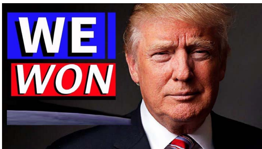
Figure 3. Descriptive representations of Trump’s power in 4Chan memes

formal occasion and he is someone to be respected. The colours of the accompanying writing and surrounding boxes mirror those of the American flag suggesting a national event. What has been ‘won’ is not indicated in the thread or image, though it is likely the meme originally referred to Trump’s election in 2016. In any circumstance, this is an empowering image. But like the images in the previous section, this is more symbolic than real. The background, again, gives no clues as to any particular event or issue. The image and context connote no real action and agency. Trump is not represented doing anything to anybody. However, this meme is about his power and ‘us’ being a part of this, though nothing is defined or quantifiable.