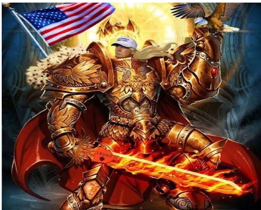
Figure 2. Symbolic power and nationalism in ‘God Emperor Trump’ images

Like the posts, the meme expresses admiration for Trump. Again, this is not about ‘real’ political power, like the power to cancel Obamacare, build a wall on the Mexican border, close the borders to Muslims or curtail criticisms in the press. This is symbolic power, confirming posters’ admiration and pride towards Trump and Trump’s America. Similarities between figures one and two include Trump’s head mashed-up with the body of Emperor of Mankind. Both images see Trump’s head small, yet salient through the use of colours, lighting and focus. Low modality through an indistinguishable background is also common, connoting both symbolic power over ‘real’ power and Trump as a mythical character.