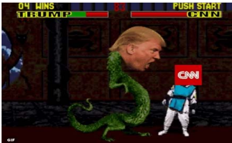
Figure 5. Meme of Trump as Liu Kang from the Mortal Combat game

In figure six, Trump again dominates the image. Here, his head is mashed on to the Hulk from The Avengers film (2012). In this image, Trump faces us, allowing viewers to witness his anger. The vertical angle of interaction emphasises his strength. In the original film, the Hulk fights Loki, a villain. Here Trump's head is mashed on to the superhero's body as he holds the villain by the feet in a sequence that sees the Hulk physically brutalise Loki. It is a one-sided fight due to the Hulk's enormous strength. Here, the superhero Trump physically brutalises CNN. This show of strength and connotations of who is right and who is wrong would not be lost on viewers, confirming their beliefs that mainstream media are wrong, it being 'fake news'. All the while, the meme offers no evidence or context for such assertions, just metaphoric over literal representations of actions that emphasise power and anger.