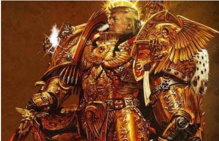
Figure 1. 'God Emperor Trump' image in pro-Trump 4Chan thread

small compared to the massive body in the montage. However, both head and body are salient connoting importance and power. His body is salient through its size. But the meme's message of Trump as powerful would be lost on his fans if his head was difficult to identify. Light, focus and colour make his head salient. Furthermore, it is in focus and importantly, the creator of the image has suggested other-worldliness by including what looks like a halo around Trump's head to guide our eyes towards him.