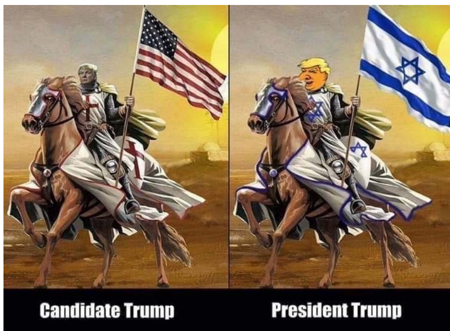
Figure 7. An anti-Semitic far-right meme critical of Trump on 4Chan

On the left, Trump is salient, with his head mashed on to a knight. But his head is not as salient as in previous memes that used lighting, colour, focus and/or size for salience. Here his head is distinguishable, but small. The horse and American flag are far more salient, the flag being both large and a potent cultural symbol. Like the positive images examined above, Trump is looking to the horizon – a man with a vision. This image connotes positivity, though not as obvious as previous examples. It provokes longing for a time when Trump had a vision as a candidate. His facial expressions, though difficult to distinguish, are stern and serious, like a crusader, off to make America Great Again.