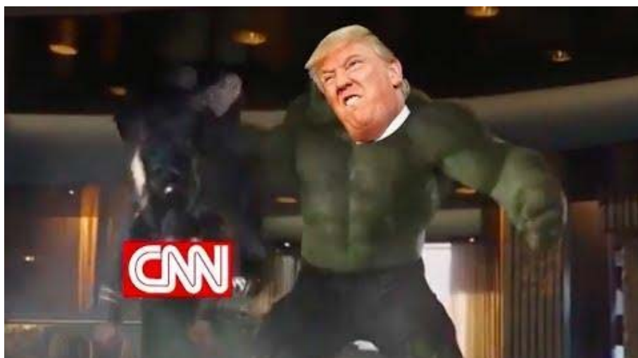
Figure 6. Trump as the Hulk from The Avengers film (2012)

In figure six, Trump again dominates the image. Here, his head is mashed on to the Hulk from The Avengers film (2012). In this image, Trump faces us, allowing viewers to witness his anger. The vertical angle of interaction emphasises his strength. In the original film, the Hulk fights Loki, a villain. Here Trump's head is mashed on to the superhero's body as he holds the villain by the feet in a sequence that sees the Hulk physically brutalise Loki. It is a one-sided fight due to the Hulk's enormous strength. Here, the superhero Trump physically brutalises CNN. This show of strength and connotations of who is right and who is wrong would not be lost on viewers, confirming their beliefs that mainstream media are wrong, it being 'fake news'. All the while, the meme offers no evidence or context for such assertions, just metaphoric over literal representations of actions that emphasise power and anger.