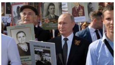
Photo 2. President Putin with participants of Immortal Regiment. © Sputnik / Alexey Druzhinin