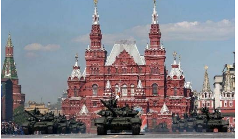
Photo 3. Tanks on Red Square during Victory Day parade.