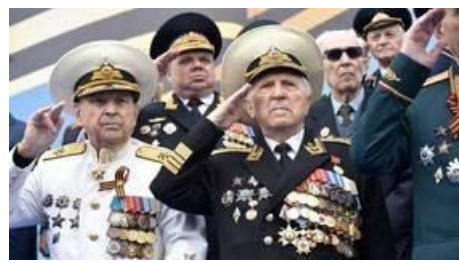
Photo 1. Veterans salute during the Victory Day parade at the Red Square in Moscow, Russia, marking the 74th anniversary of defeating the Nazis in the WWII.