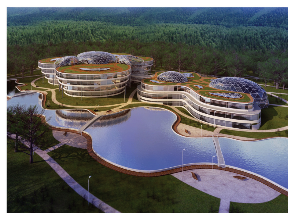
Fig. 1. "Maternity Center, a Pilot-Project"/ Diploma-Work of Kupina Y.O.