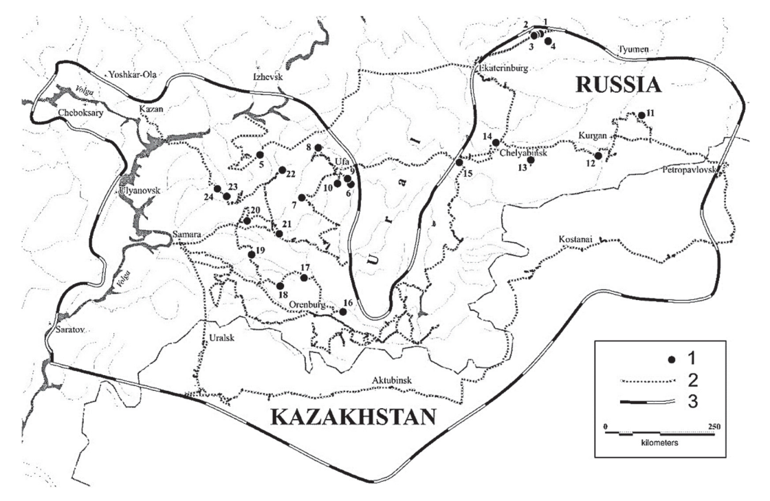
Figure 1. Investigation area (compiled from [1–3] with changes): 1 – studied settlements (settlement numbers correspond to the numbers in Table 1); 2 – route expeditions 2016–2018; 3 – border of russet ground squirrel distribution

1 -ground squirrels have been always, and they are now; 2 -ground squirrels were many but now they are few; 3 - ground squirrels were many but now they are none; 4 - ground squirrels were always few; 5 - ground squirrels have been never. Categories 1-4 include data from literature [1, 6; 7; 12; 19-21] in addition to the respondent reports. Our findings were categorized as follows: 1 - ground squirrels were observed; 2 - no ground squirrels were observed, inhabited burrows were found; 3 - only uninhabited burrows were found; 4 - no burrows were found. All found settlements were divided into 3 categories for convenience as follows: 1 - successful; 2 - stable; 3 - endangered. The settlements were categorized basing on general estimations of the area size and activity of animals. Due to the fact that russet ground squirrels are strongly attracted by pastures as it was shown earlier [1], we estimated the grazing pressure intensity on potential habitable for russet ground squirrel places during our survey by categories as follows: 1 – intensive grazing affecting the vegetation cover significantly; 2 - low pasture pressure weakly and locally affecting on vegetation; 3 - no pasture pressure. Different completeness data are collected for 168 localities.