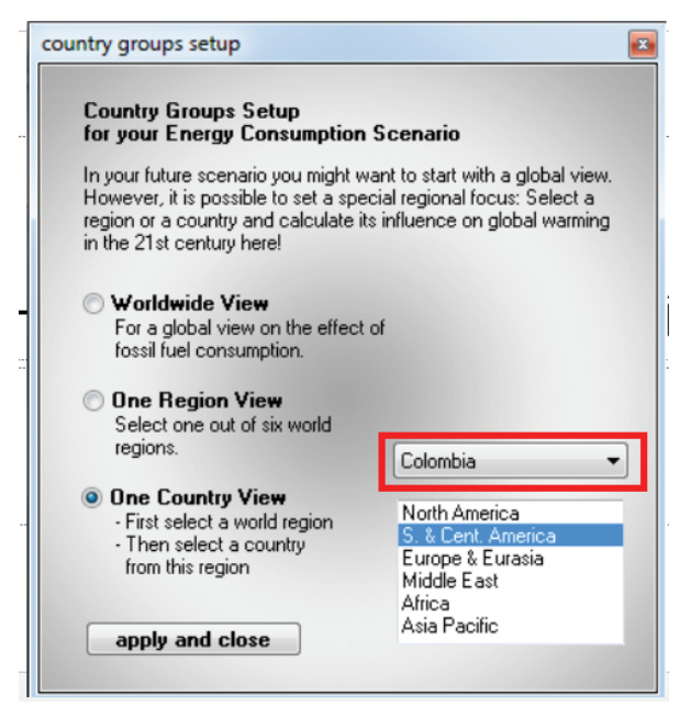
Fig. 3. Selecting region, countries or globally

Take a look at the influence of one country here. Make special future emissions settings for this country as well as special settings for the rest of the world. Due to database restrictions not all 190+ countries of the world are available in the list, in many cases countries are only available as country groups (F.3.)